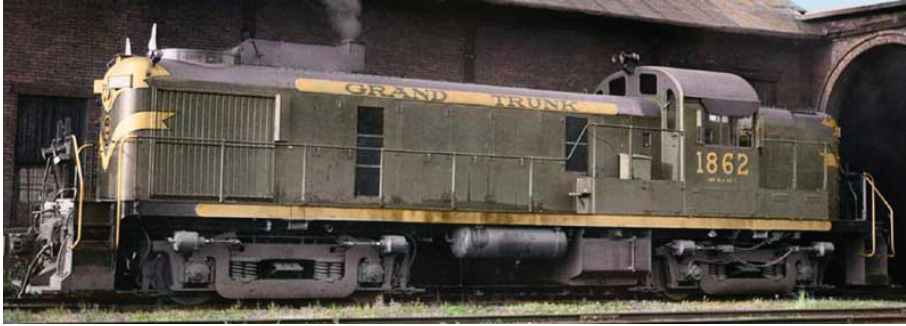
taken in 1955