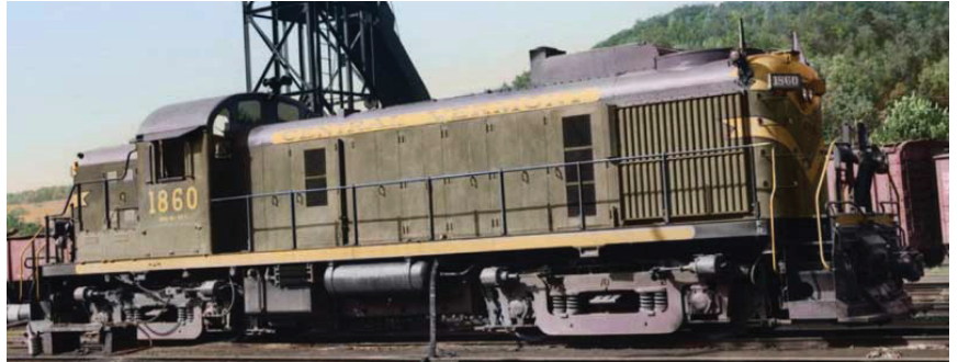
taken in 1955