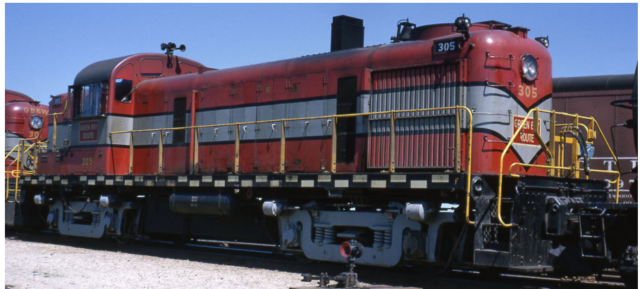
Photo: Kewaunee, WI 6-20-64 Stanley R. McCarthy (Eddie Gross Collection)